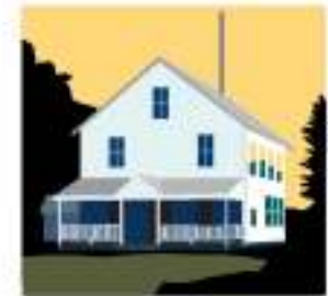
EAST WARREN COMMUNITY MARKET